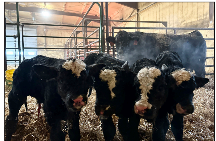
The Stavick Simmental Quads are now being followed on social media.

Very early Wednesday morning, about 2:00 a.m., the day before their anniversary sale, the ranch welcomed a set of quadruplets, four healthy bull calves to one momma!