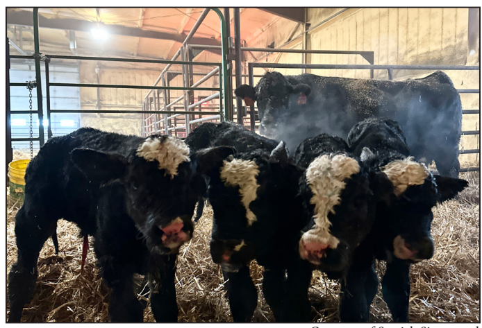
The Stavick Simmental Quads are now being followed on social media.

Very early Wednesday morning, about 2:00 a.m., the day before their anniversary sale, the ranch welcomed a set of quadruplets, four healthy bull calves to one momma!